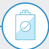
Planning and Initial Investment